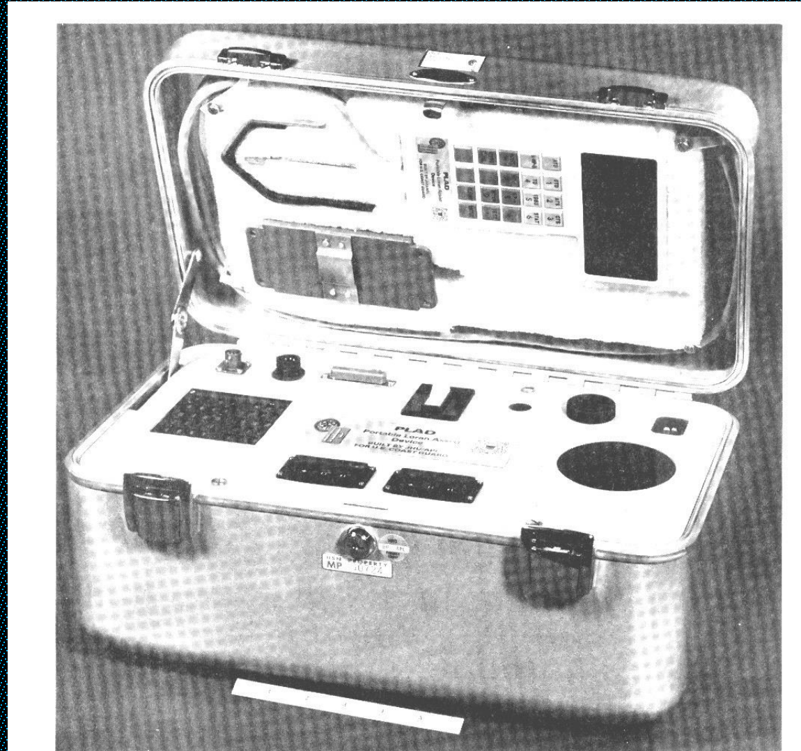
Fig. 1 PLAD.